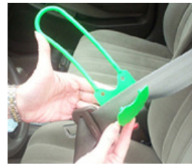
Seat Belt Easy Reach