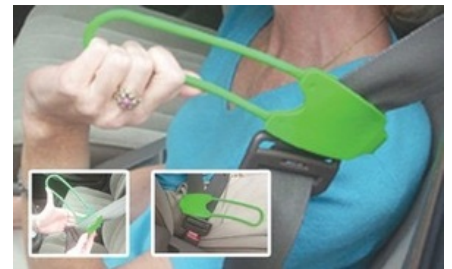
PR05295 Making Life Easy Seat Belt Easy Reach

A plastic seat belt reacher that clips onto most lap sash seat belts. It reduces the reach required to pull the seat belt across the torso. Useful for people with restricted arm and shoulder movement. Simple and portable it clips onto most lap sash belts to reduce arm and shoulder strain when pulling belt across body. May be suitable for people with arthritis or shoulder pain.